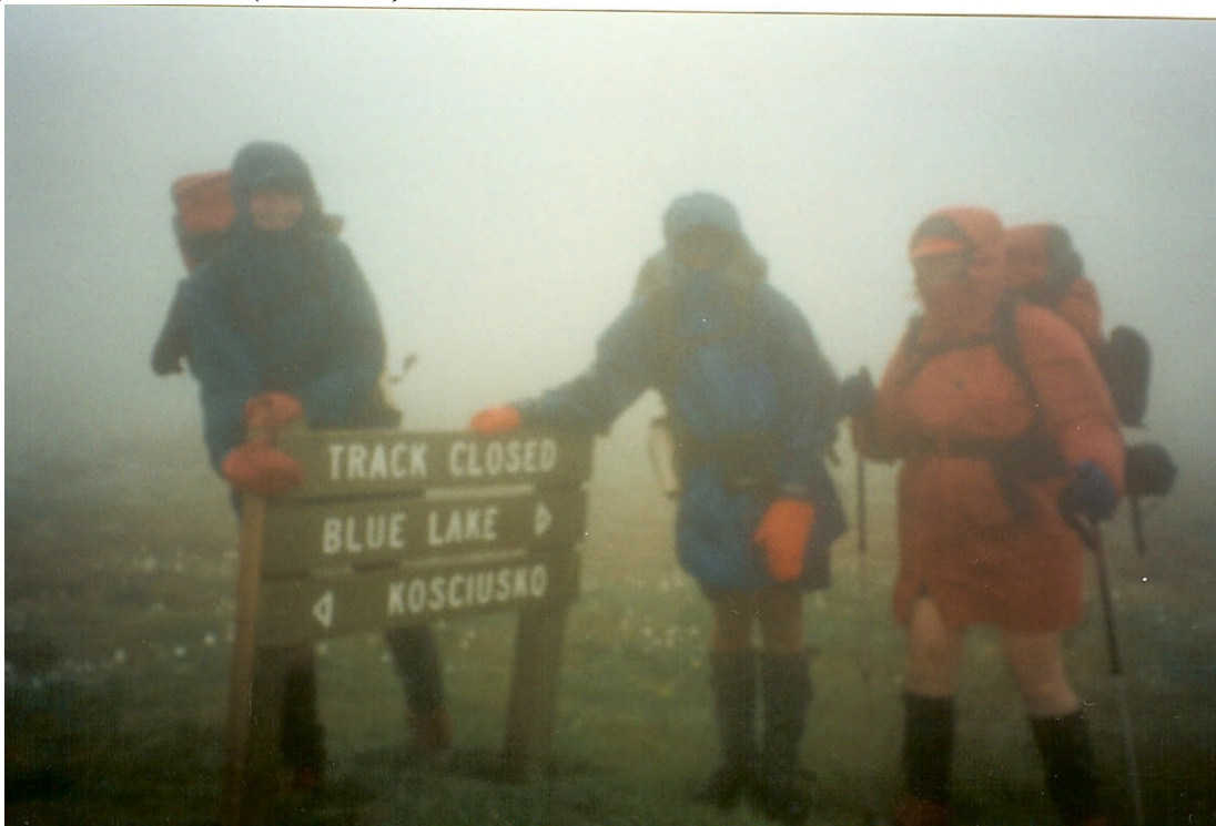
We really enjoy our blizzards!