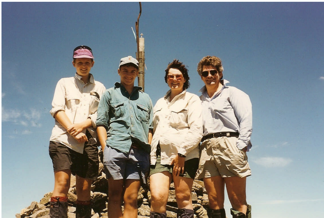
On Mount Bogong